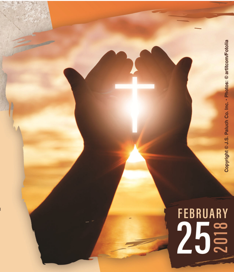
Copyright © J.S. Paluch Co. Inc.