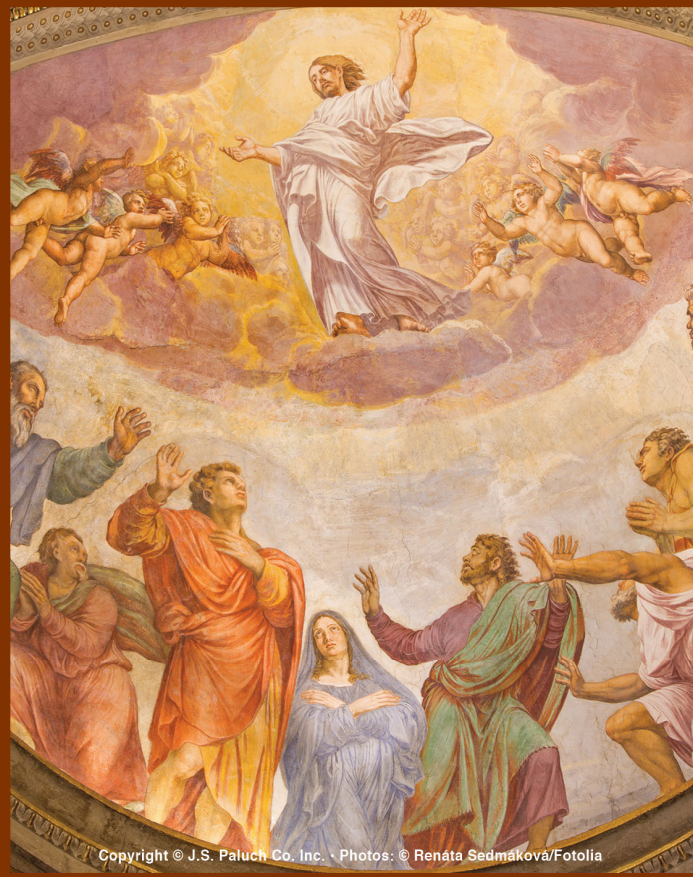
Copyright © J.S. Paluch Co. Inc. · Photos: © Renata Sedmakova/Fotolia